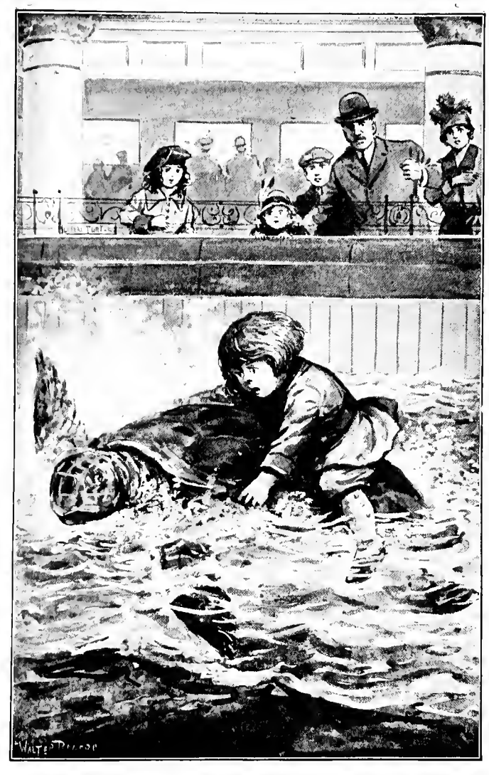
"FREDDIE FELL IN!" "HE'S ON THE BACK OF A BIG TURTLE." The Bobbsey Twins in a Great City. Page 128